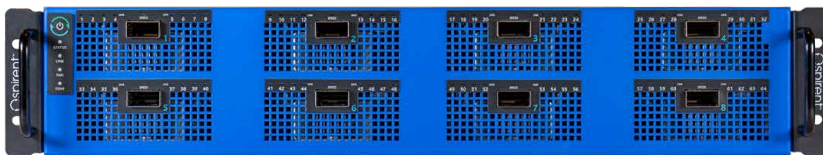
Spirent B2 800G 8-Port Appliance

Terabit Routers —Test latest generation of core routers with high-scale, multiprotocol topologies.